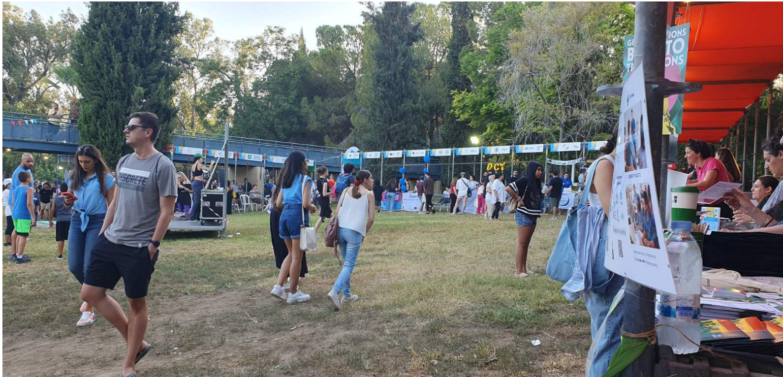
Official Photo from ONEK on the start of the NGO Fair "Up To YOUth Festival 2023"

decided on Digital Marketing for the third time because there has always been great interest in the said training. As for bookkeeping, by researching the job supply and demand market at the local level, we come to the conclusion that this is another excellent topic for training young people. Also, training for Web designers is announced, and we are looking forward to international training in English for Digital Marketing.