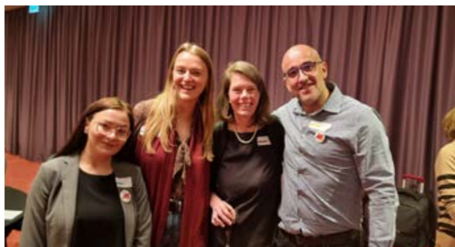
Participation in the 5th Annual Seminar