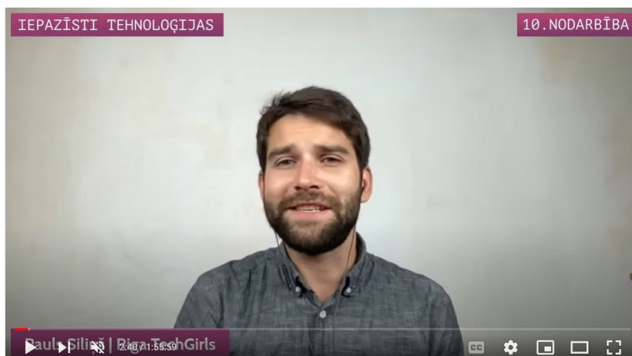
Screenshot from Latvian Transversal Skills Live Workshop

To assist the candidates who went for interviews we have assigned mentors to each candidate who will offer 1 hour of one-on-one time, either face to face, telephonically or via digital means. This started end of September and all candidates have concluded all their interview phases. In addition to the 1-hour one-on-one sessions, group mentoring sessions will be held in a classroom type environment to assist with CV preparation and preparation for the interviews. As the interviews started beginning of October