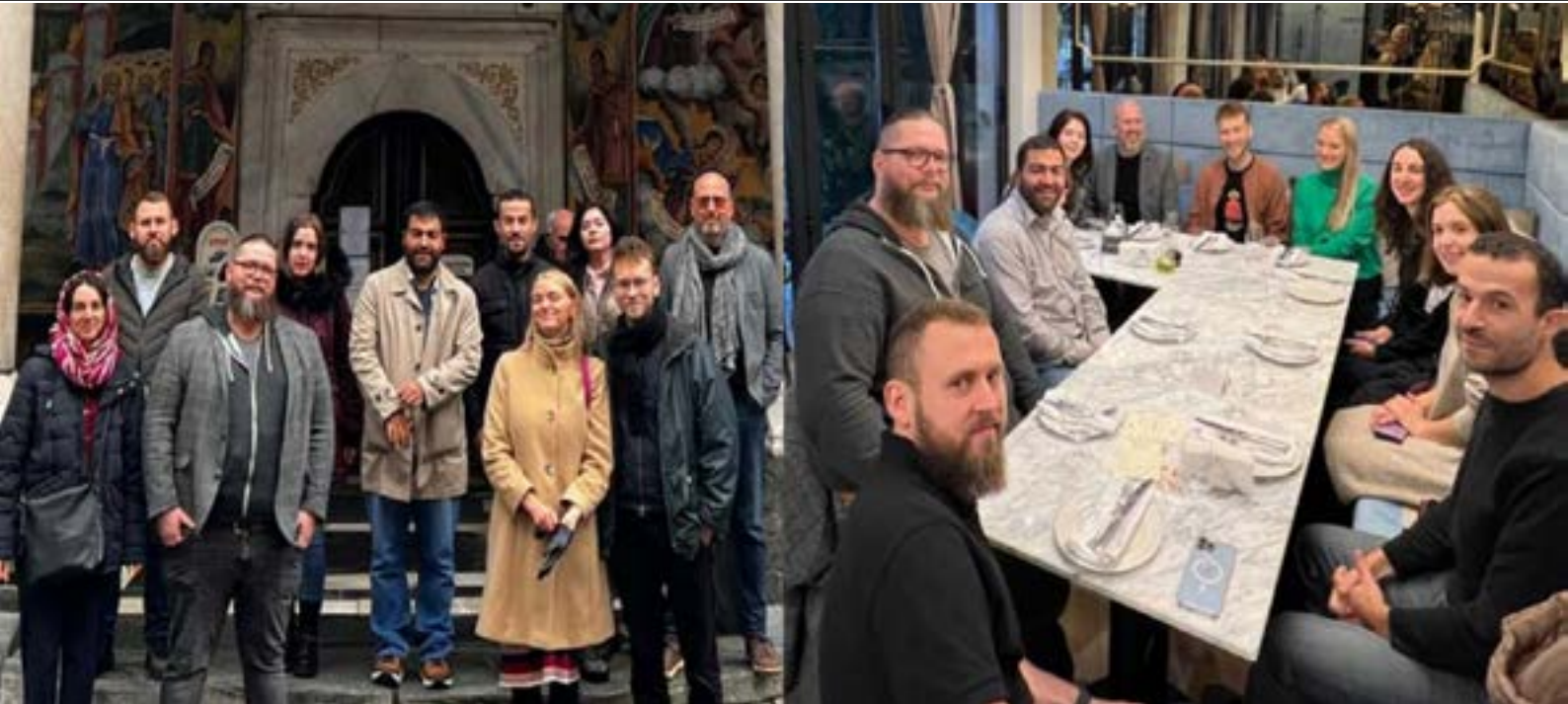
Photo from the TPM held in Bulgaria