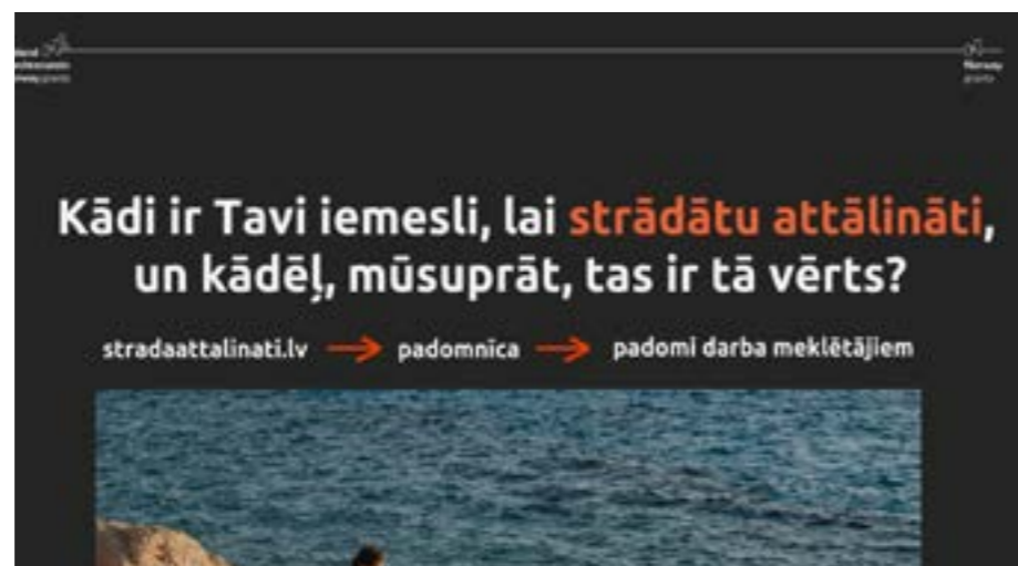
Banner from Latvia

We continue now and focusing on the rest of the job match making events, International and Local Conference and the ongoing Mentoring Program.