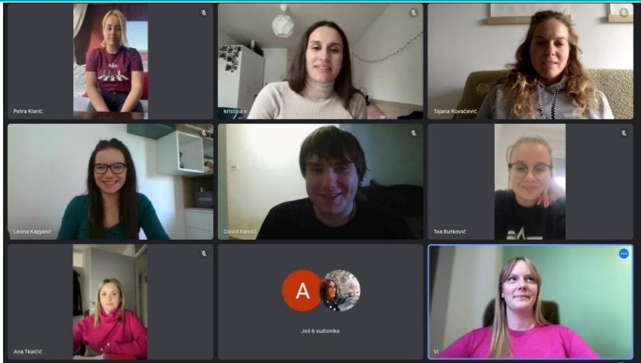
Online Screenshot from Croatian Training.