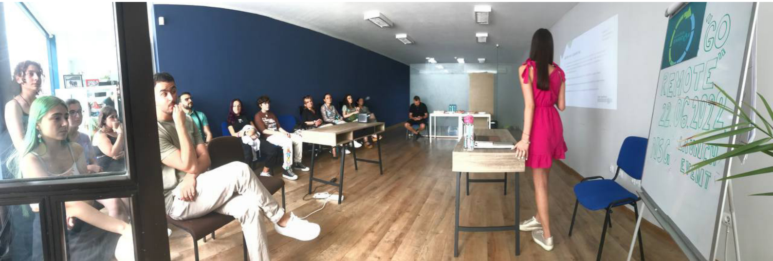
Bulgaria Launch Event