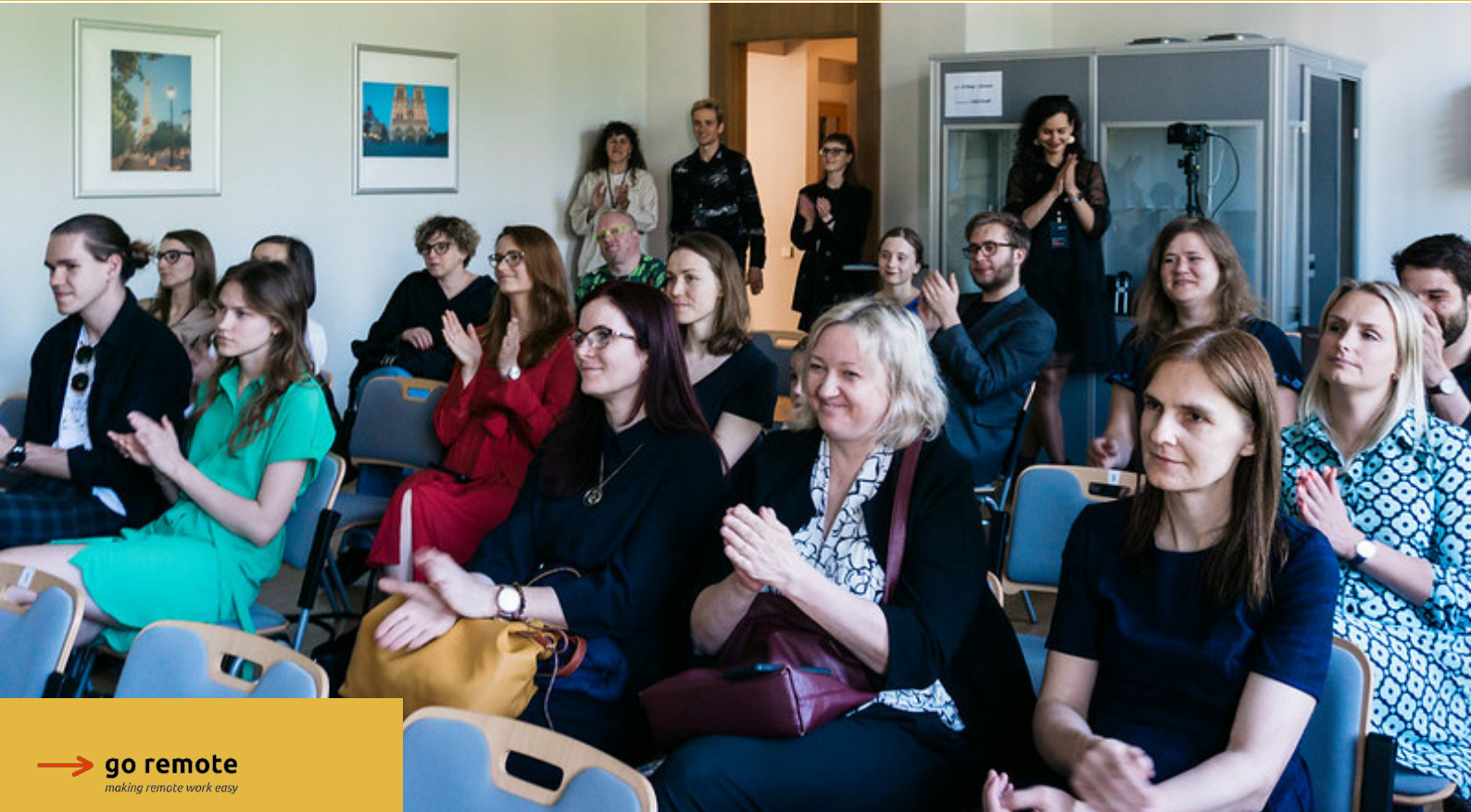
Latvia Launch Event