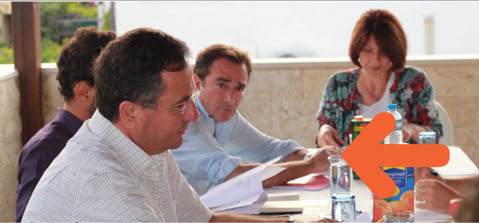
Cyprus Launch Event