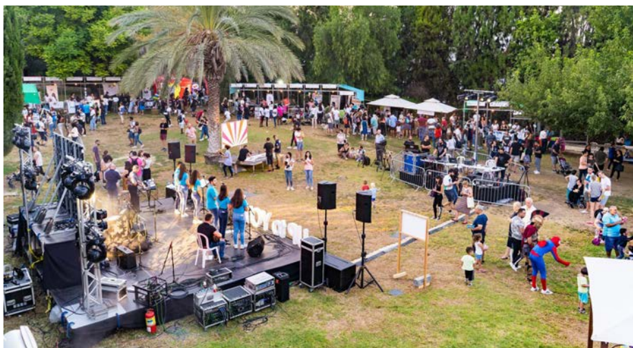
From Cyprus NGO Fair 2019

We would like to wish everyone to have a wonderful relaxing summer and stay tuned for the upcoming events and the development of our international and local trainings.