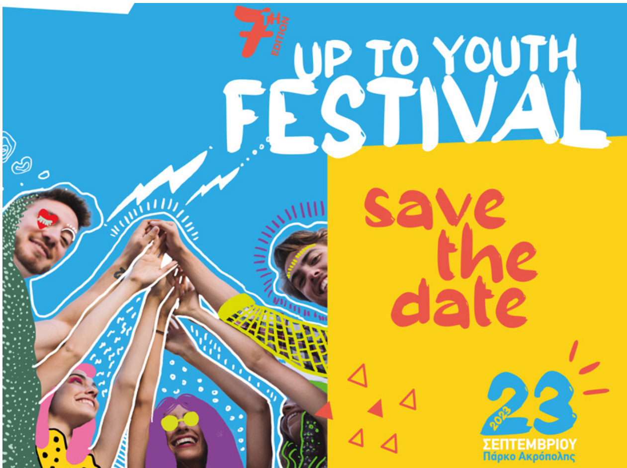
UpToYouth Festival 2023