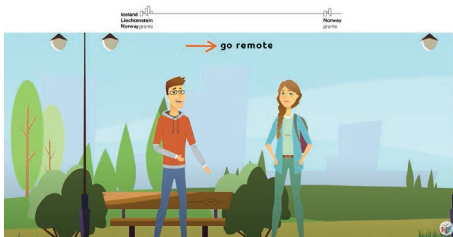
Screenshot of the animation promotion of Go Remote for the Cyprus multicultural youth community

The main goal of the project is to increase the quality and number of remote work opportunities, making remote work available not only to the upper class but also to those who need it the most - young people who come from less developed areas, facing demographic, social and economic