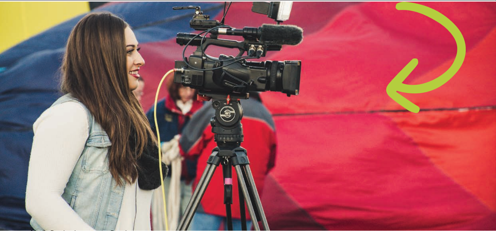
Media Production

“...making remote work available not only to the upper class but also to those who need it the most..”